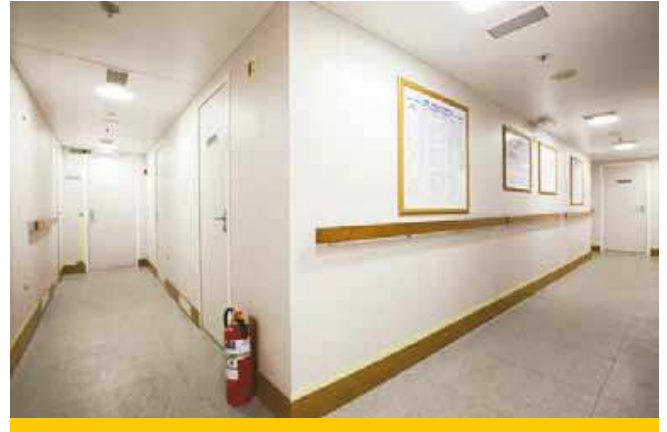
Some ceiling supporting profiles

It may be manufactured in different length ranges up to 2500 mm, even in some cases could be 4000 mm. The NAVALIBER B-15 self-supporting ceiling is remarkable not only because of its mobility but also because of their acoustic and thermal insulation.